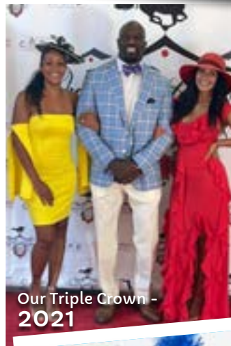
Our Triple Crown - 2021