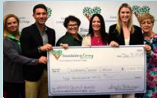
FOC Check Presentation

“My cancer journey has been bitter sweet so far. I say that because of the times when I thought there was no reason to push forward, there was an organization of caring and loving people that reached out to me and offered me an outlet. They gave me something to do and interesting people to meet. They lifted my spirit and recharged me in ways I could not have imagined. They plugged me into as many sporting events as I could handle. It did keep me focused on the fight and my reason to fight, because we all make a difference to someone. The Children's Cancer Center has been an oasis for me. It's helped me emotionally, mentally, and gave me purpose beyond my diagnosis. I am eternally in their debt and consider them a part of my family.”