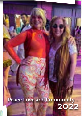
Peace Love and Community - 2022