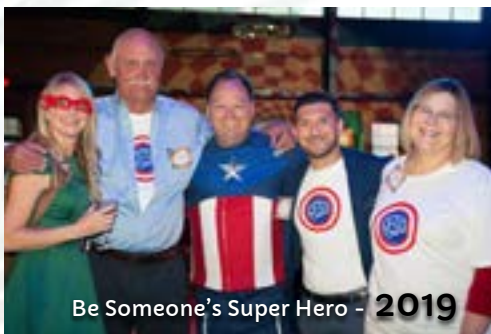
Be Someone's Super Hero - 2019