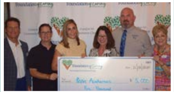
Pepin Academies check presentation 2024

The Foundation of Caring was created with a singular mission: to be a beacon of hope and a catalyst for community change. By coming together—individuals, businesses, and organizations alike—we pool our collective resources to support meaningful, lasting transformation. Every gift plays a vital role in helping our partner nonprofits change lives. And, because each charity we support is carefully vetted by our Board of Directors, you can trust that your generosity will go where it's needed most, making the greatest possible impact.