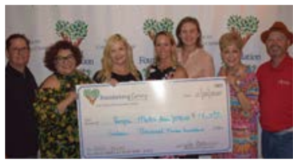
YMCA check presentation 2024

What makes the Foundation of Caring truly special is its focus. Unlike most medical foundations, FOC doesn't use donated funds to enhance clinic operations. Instead, nearly 94% of all donations are re-invested directly into the community, touching lives through local nonprofits.