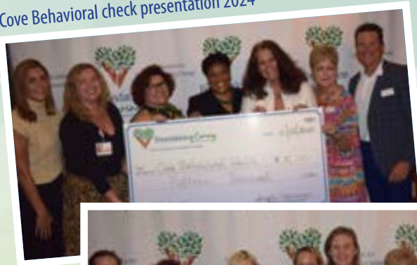
Cove Behavioral check presentation 2024