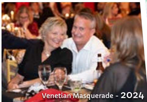
Venetian Masquerade - 2024