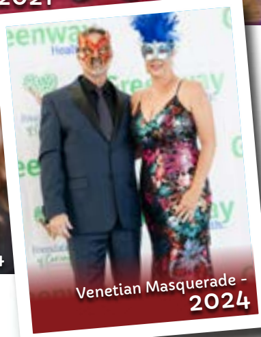
Venetian Masquerade - 2024