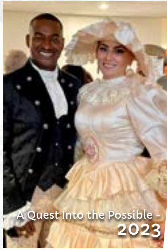
A Quest Into the Possible - 2023