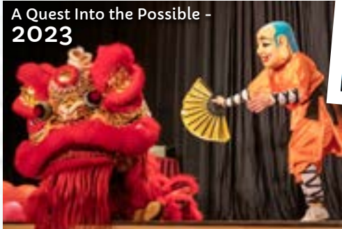
A Quest Into the Possible - 2023