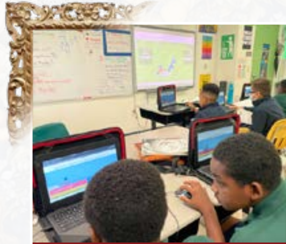
Psyched about STEM

Academy Prep serves students in grades 5-8 from low-income backgrounds in Hillsborough County. Students who attend must be eligible for the free or reduced-price federal school meals program; setting their income near or below the poverty line. With the support from a FOC grant, Academy Prep purchased 10 Interactive Projectors and 10 projection white boards for their classrooms. The goal was to make certain that the students have access to the most up to date technology, while ensuring they are not intimidated by unfamiliar tech thus closing the digital divide between them and their more affluent peers as they continue their education.